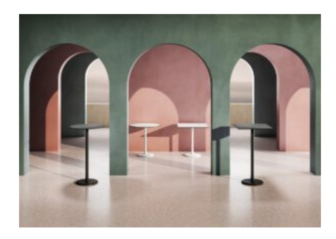
Elevate Your Hospitality Venue with Versatile Table Bases

In the world of hospitality, creating an inviting and aesthetically pleasing atmosphere is essential. Whether [...] 03 Oct