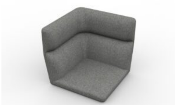
MODULO 07 - SEDUTA ALTA