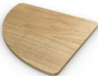
TAVOLINO 03 - ANGOLO