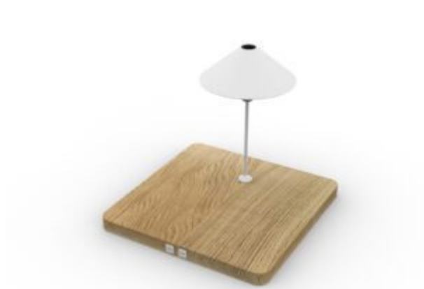
TAVOLINO 09 - LARGE LAMPADA