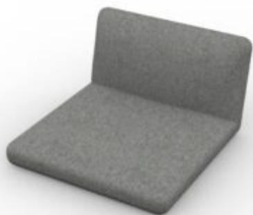
MODULO 02 - SEDUTA