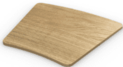
TAVOLINO 06 - CURVA INTERNA/ESTERNA