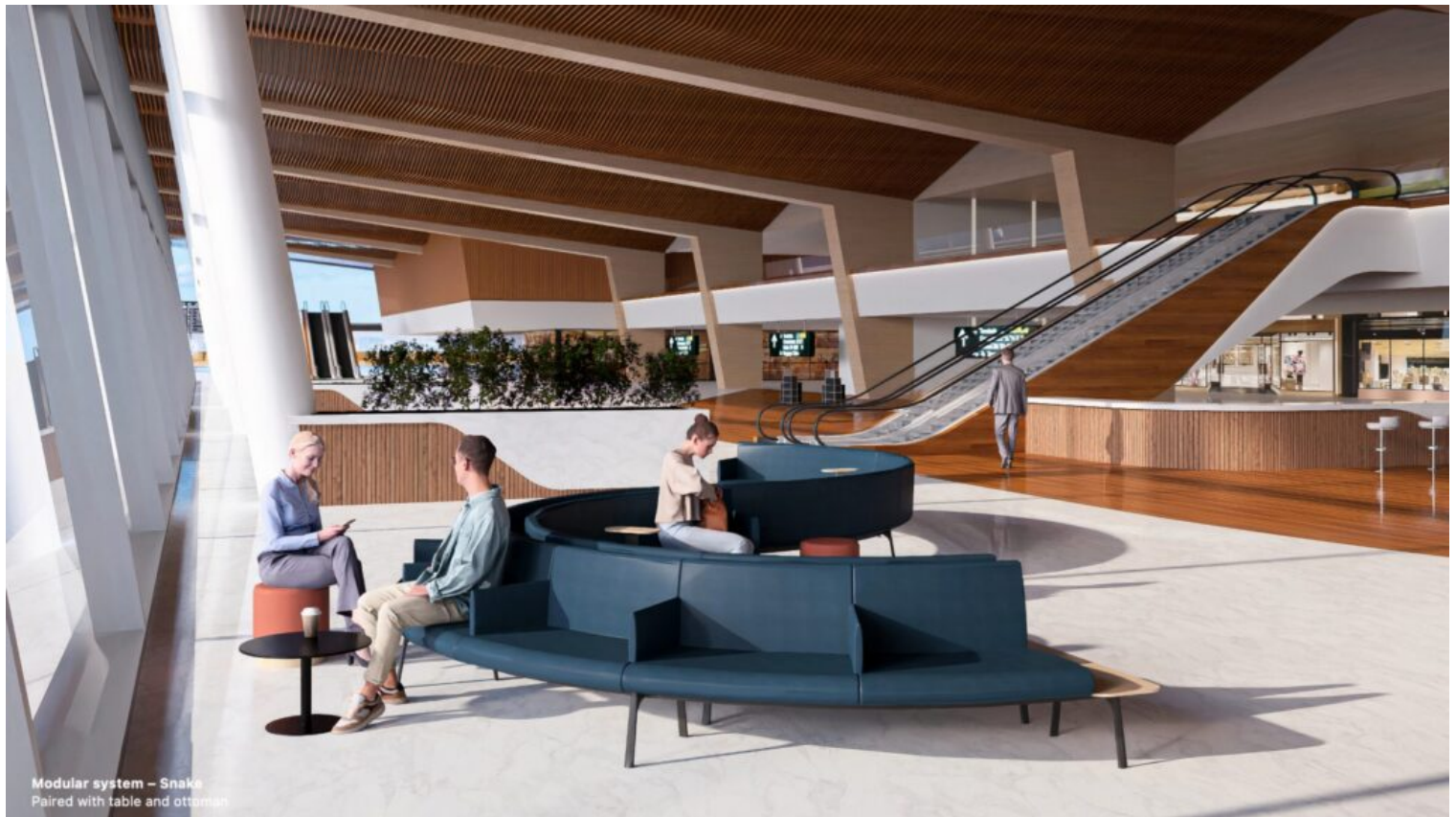
Modular system – Snake Paired with table and ottoman