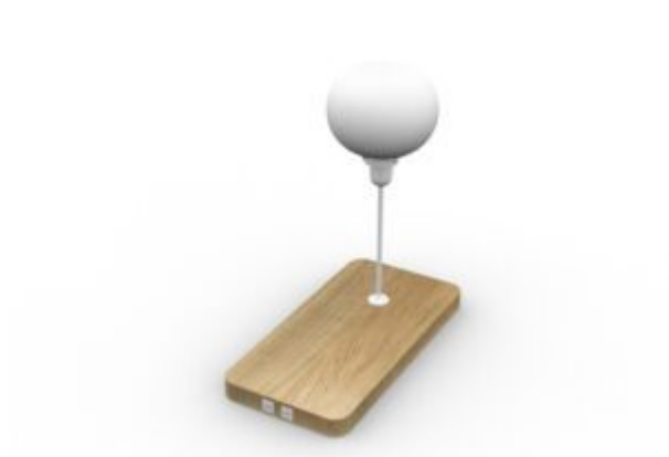
TAVOLINO 08 - SMALL LAMPADA