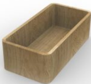
TAVOLINO 05 - SMALL CONTENITORE