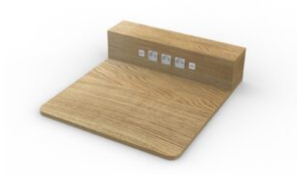
TAVOLINO 07 - CONTENITORE POWER