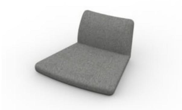
MODULO 06 - SEDUTA CURVA ESTERNA