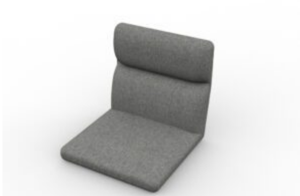
MODULO 08 - SEDUTA ANGOLO ALTA