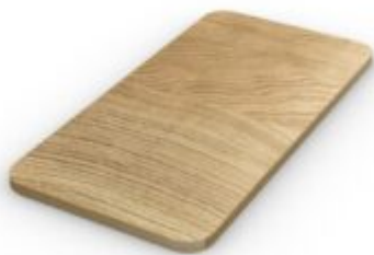
TAVOLINO 02 - SMALL