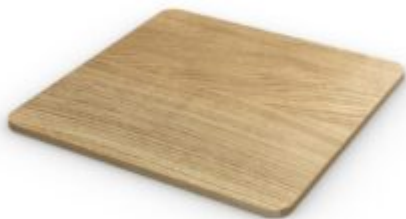
TAVOLINO 01 - LARGE