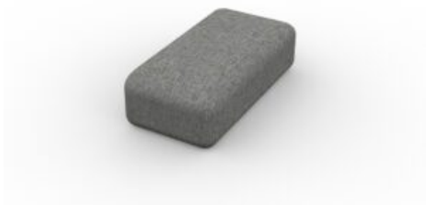
MODULO 04 - ARM