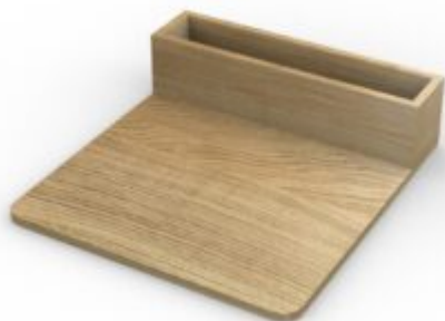
TAVOLINO 04 - LARGE CONTENITORE