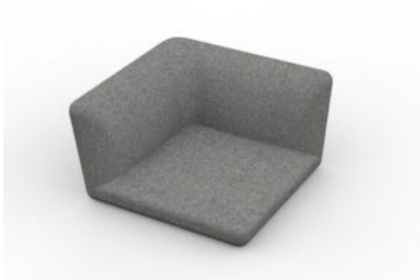
MODULO 03 - SEDUTA ANGOLO