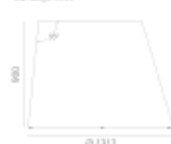
CONEE, M 60xL