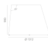
CONEE, M 60xL