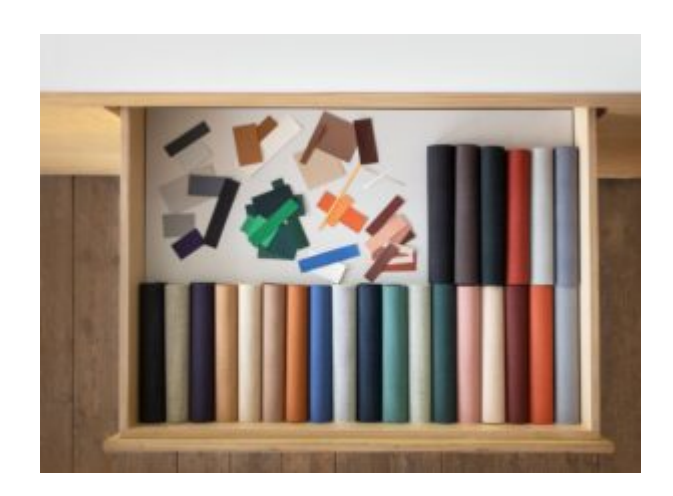
The Art of Choosing Fabrics: When and How to Use Leather, Vinyl, Crypton, and More

In the world of interior design and upholstery, fabric selection plays a pivotal role in [\dots] 03 Oct