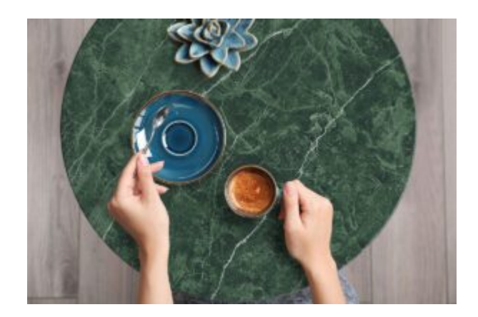
<u>The Timeless Appeal of Marble Table Tops for Hospitality and Commercial Venues</u>

Marble, with its timeless elegance and luxurious appeal, has been a favored material in architecture [...] 23 May