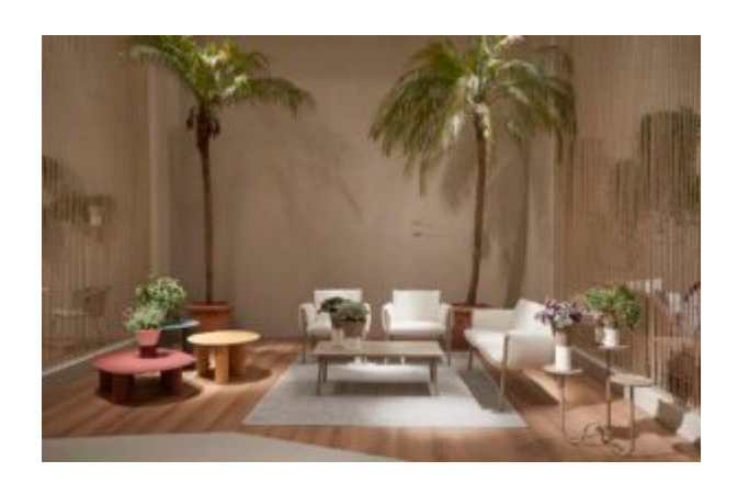
S•CAB at Salone del Mobile.Milano: A Showcase of Innovative Design

The Salone del Mobile.Milano, one of the world's most prestigious design events, recently hosted SCAB, [...] 08 May