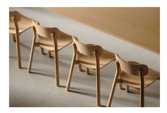
Elevate Your Hospitality Space: A Guide to Choosing Indoor Chairs

Creating a welcoming and comfortable ambiance in hospitality venues like restaurants, hotels, and cafes is [...]