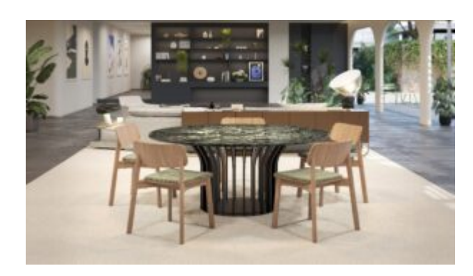
<u>Introducing Zaneti's Latest Innovations: Sauvage Chair and Cosmos Table</u>

At Hospitality Furniture Concepts, we are constantly seeking to bring you the latest and most [...] 01 Aug