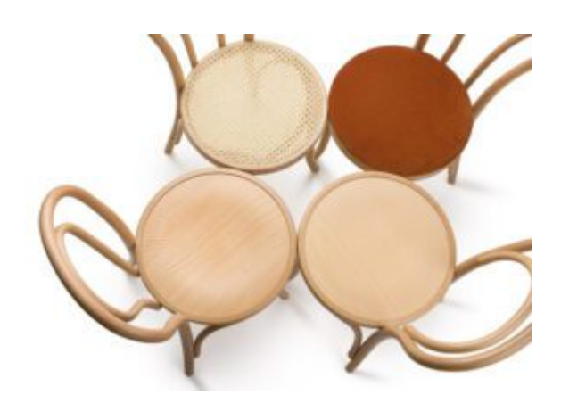
The Timeless Elegance of Bentwood Chairs: A-1840 / No. 18 - by Paged

In the realm of commercial interior design, the Bentwood chair, renowned as the A-1840 or [...] 16 Oct