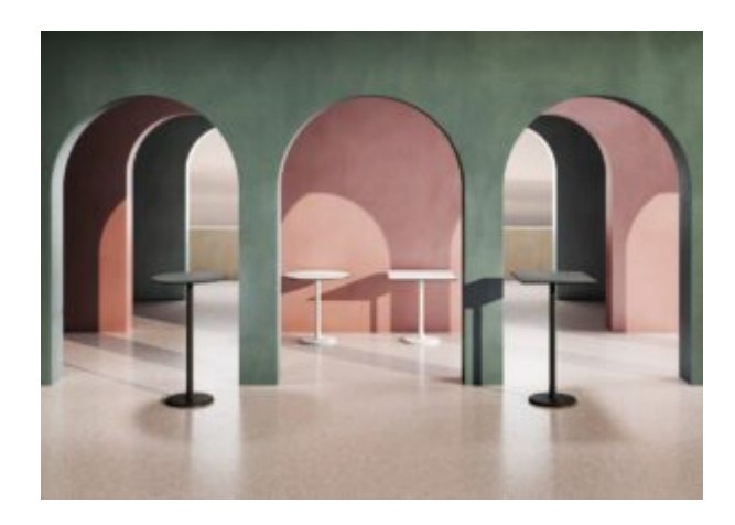
Elevate Your Hospitality Venue with Versatile Table Bases

In the world of hospitality, creating an inviting and aesthetically pleasing atmosphere is essential. Whether [...] 03 Oct