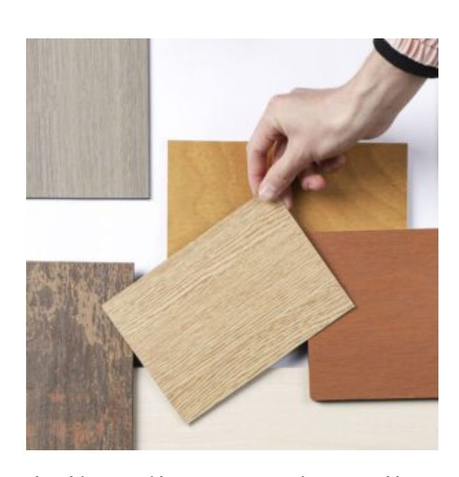
The Ultimate Guide to Compact Laminate: Durable, Versatile, and Stylish

When it comes to designing and furnishing spaces, whether for commercial, public, or hospitality use, [...] 03 Oct