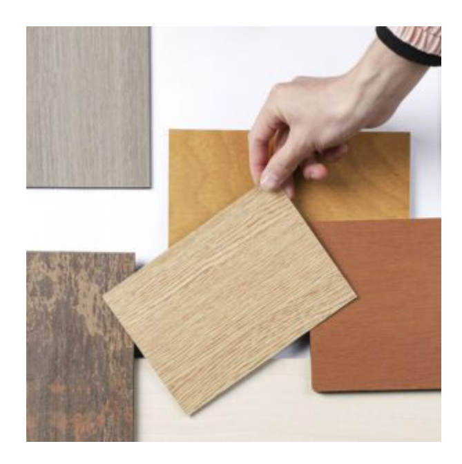
The Ultimate Guide to Compact Laminate: Durable, Versatile, and Stylish

When it comes to designing and furnishing spaces, whether for commercial, public, or hospitality use, [...] 03 Oct