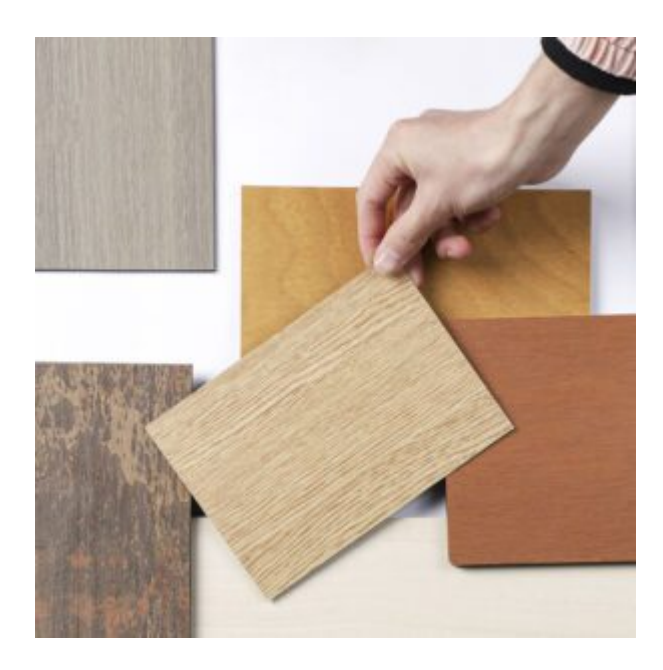
The Ultimate Guide to Compact Laminate: Durable, Versatile, and Stylish

When it comes to designing and furnishing spaces, whether for commercial, public, or hospitality use, [...] 03 Oct