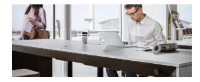
Boosting Customer Satisfaction: The Power of Public Spaces with Charging Solutions

In the bustling world of airport terminals, every detail counts in shaping travellers' experiences. At [...] 08 May