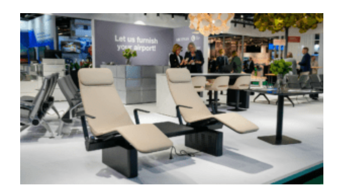
<u>Passenger Terminal Expo - Elevating Passenger Experiences: HFC's Partners Shine</u>

In the bustling world of airport terminals, every detail counts in shaping travellers' experiences. At [...] 08 May