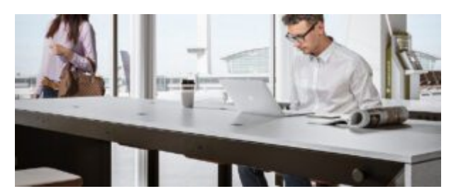
Boosting Customer Satisfaction: The Power of Public Spaces with Charging Solutions

In the bustling world of airport terminals, every detail counts in shaping travellers' experiences. At [...] 08 May