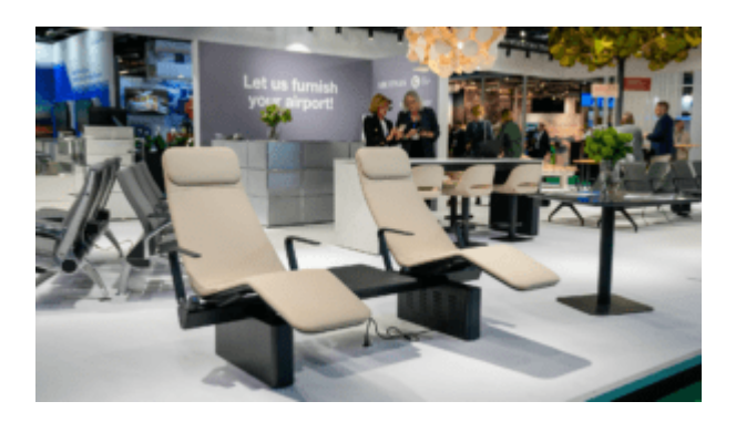
Passenger Terminal Expo - Elevating Passenger Experiences: HFC's Partners Shine

In the bustling world of airport terminals, every detail counts in shaping travellers' experiences. At [...] 08 May