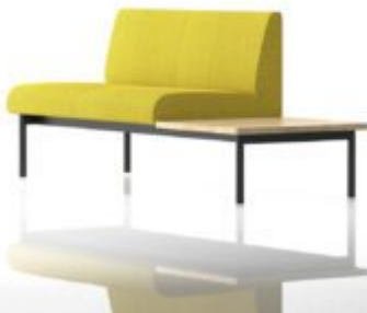
2 Seat + 1 Table