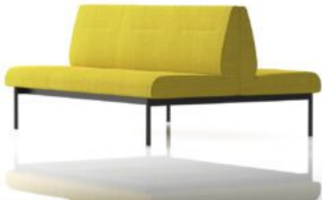
3 Seat High Back - Back to Back