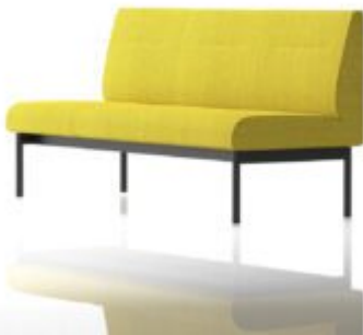
3 Seat - High Back