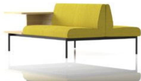
High Table - 2 Seat Back to Back