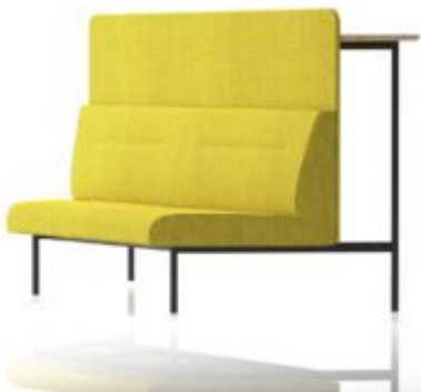
Angled - 2 Seat Back to Back (high back) - with rear high table