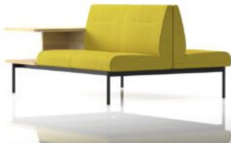
High Table - 2 Seat Back to Back (High Back)