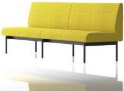
4 Seat High Back