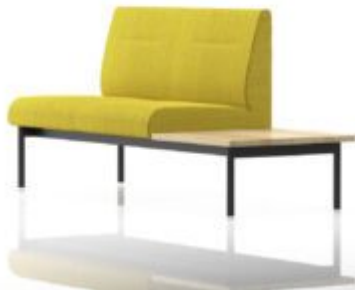
2 Seat High Back + 1 Table