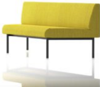
3 Seat Back to Back (high back)