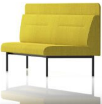
Angled - 2 Seat Back to Back (high back) - with rear acoustic panel