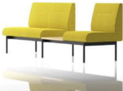
2 Seat + 1 Table + 1 Seat (High Bac)