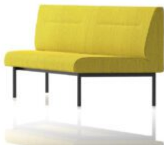
Angled - 2 Seat Back to Back