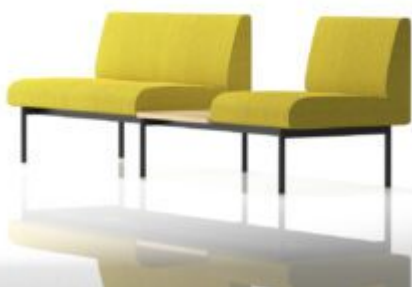
2 Seat + Table + 1 Seat