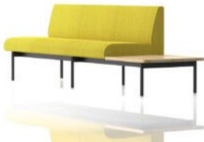
3 Seat + 1 Table