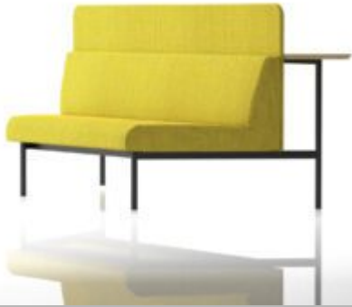
Angled - 2 Seat Back to Back (high back) - with rear high table