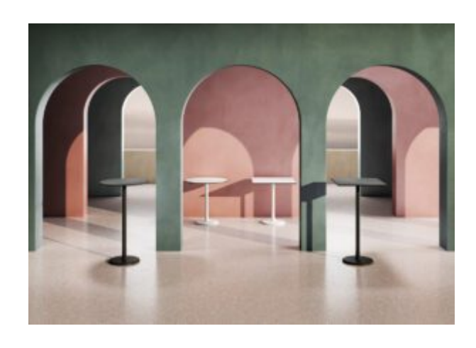
Elevate Your Hospitality Venue with Versatile Table Bases

In the world of hospitality, creating an inviting and aesthetically pleasing atmosphere is essential. Whether [...] 03 Oct