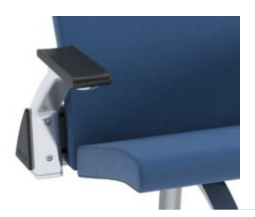
Standard Arm - No Power