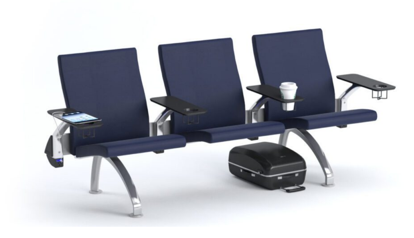
Place power with drink holder tablet arms

View the Place in our virtual showroom here.