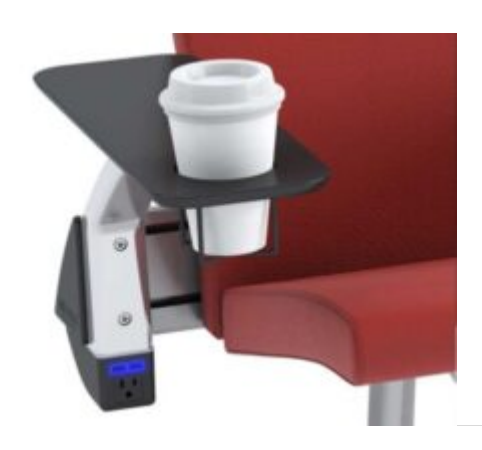
Cup Holder Arm