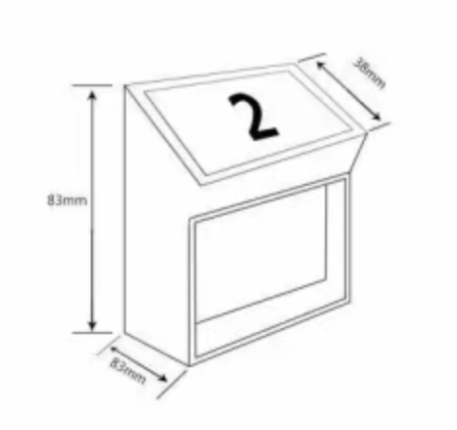
Aisle number with light

Unique product design, exquisite design craft. Using high-quality aluminium alloy through die-cast moulding the Poltrona Theater Seats bring design to every public space. Torsional spring damping recovery mechanism with automatic reurn.