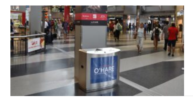
Related Blog Content