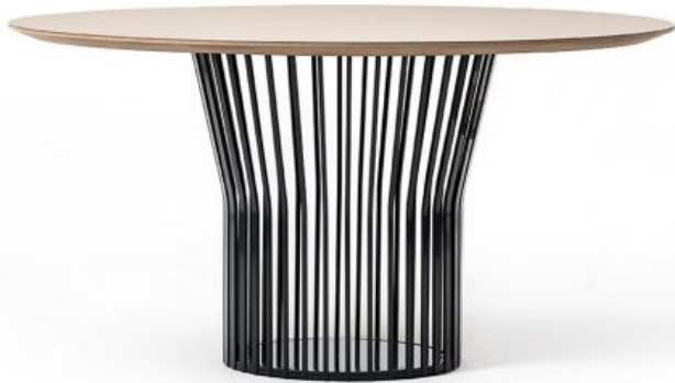
Table with metal frame and top in wood, HPL, glass ceramic or marble. Also available in outdoor version.