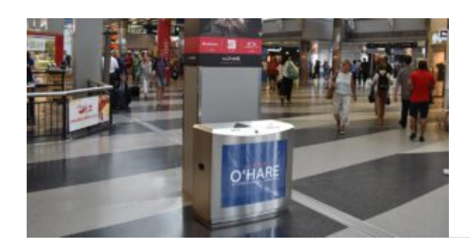
Related Blog Content