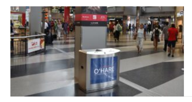
Related Blog Content