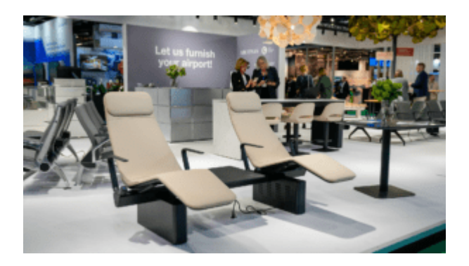
Passenger Terminal Expo – Elevating Passenger Experiences: HFC's Partners Shine

In the bustling world of airport terminals, every detail counts in shaping travellers' experiences. At [...]